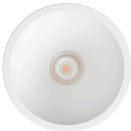
Detalle interior / Interior Detail